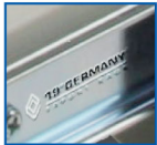
19" GERMANY Sliding Rail